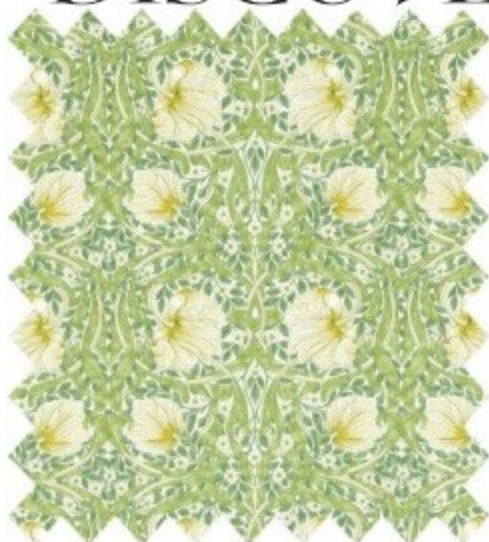
MORRIS & CO. PIMPERNEL FABRIC; TO THE TRADE. SANDERSONDESIGNGROUP.COM

FOR MORE GREAT FINDS VISIT ARCHDIGEST.COM/SHOPPING