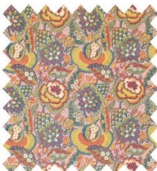
LIBERTY OF LONDON PATRICIA COTTON VELVET; TO THE TRADE. FABRICUT.COM