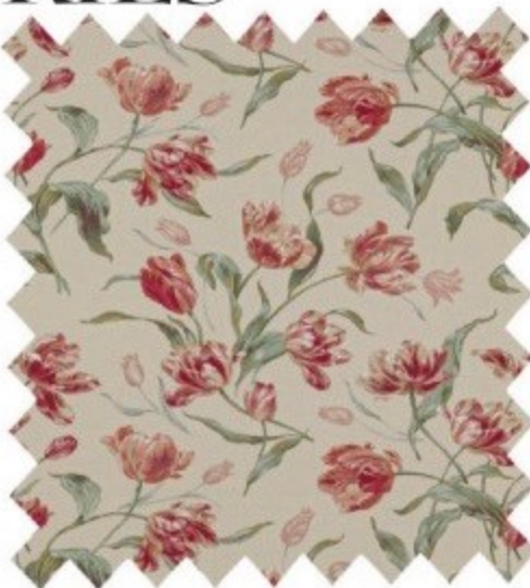
COLEFAX AND FOWLER PRIMAVERA FABRIC; TO THE TRADE. COWTAN.COM