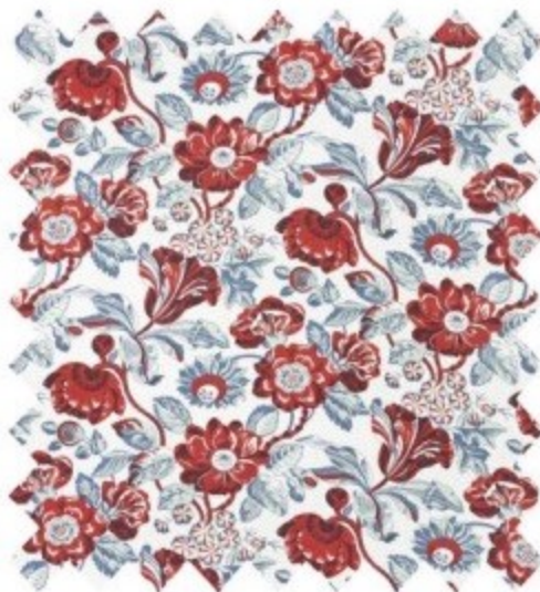
RAOUL TEXTILES MICHEL LINEN; TO THE TRADE. RAOULTEXTILES.COM

Florals for spring? Timeless. Behold our fave new fabrics in bloom