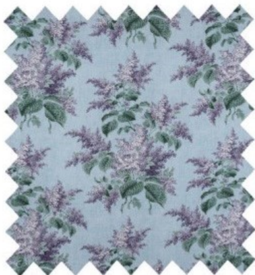
LISA FINE TEXTILES CHARLOTTE LINEN; TO THE TRADE. LISAFINETEXTILES.COM