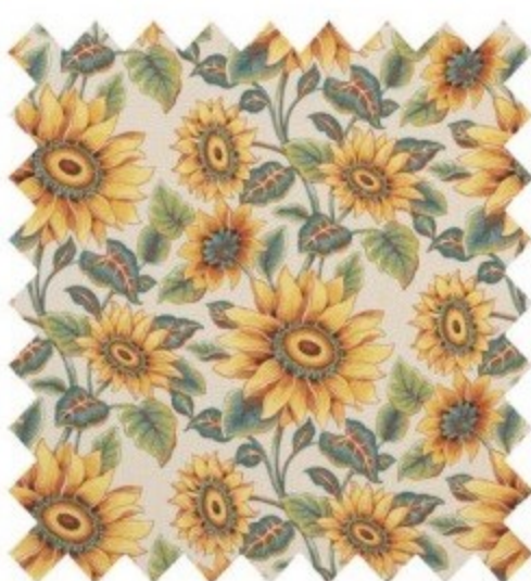
DÉCORS BARBARES LES TOURNESOLS LINEN; TO THE TRADE. DECORSBARBARES.COM